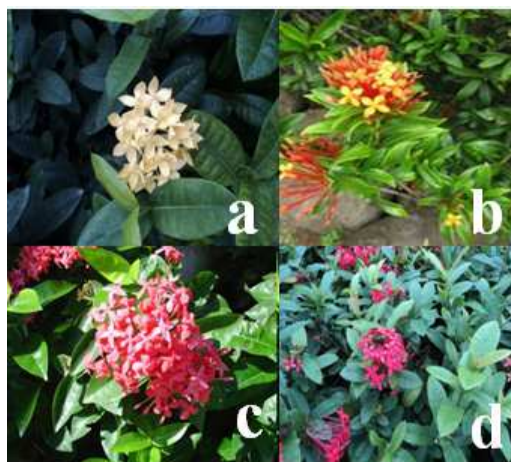
Figure 3. Flower formation in Ixora coccinea hybrids. a: Chanmai; b: Vulcanus; c: Nora grant; d: Kontiki

The results revealed that the plants in the control did not show any flower initiation at both light levels. However, all the treatment combinations showed more than 40% of flower initiation under both light conditions (Fig. 1 & 2) though the percentage of flower formation varied according to the variety (Fig. 3). The highest flower induction (100%) was observed in the hybrid Nora grant under shade condition (Fig. 2). The hybrid Vulcanus showed only 20% of flower initiation in few treatments while no flowers were observed in other treatments (Fig. 1 & 2).