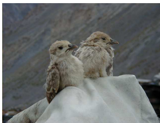
Figure 2. Wildlife watching.

There is a great diversity found in the opinion of respondent regarding the motivational facilities (Fig.4).