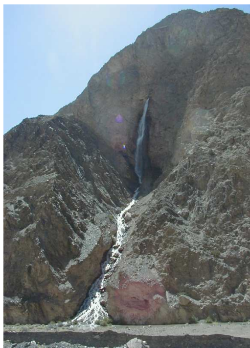
Figure 3. Water falls.