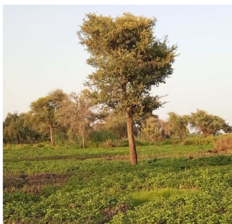
Figure 2. Ipomoea batatas crop under Faidherbia albida trees.

F. albida is an important plant species used in soil restoration in the Sahelian zone [36]. It is a fixing nitrogen